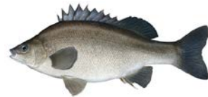
Silver perch Bag Limit 2 Size Limit >33cm