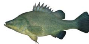
Golden perch Bag Limit 2 (Callop) Size Limit >33cm